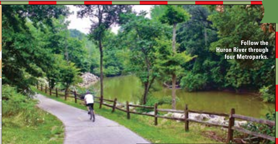
Follow the Huron River through four Metroparks.